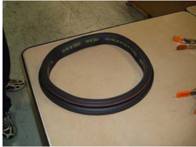
12. Completely folded gasket