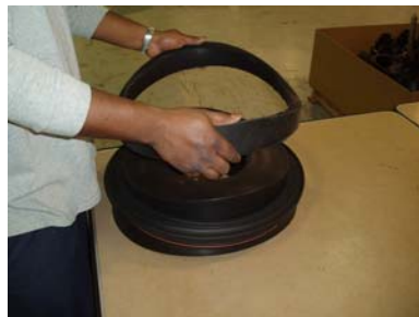
16. Fit casting ring behind gasket on mandrel, aligning arcs of both.