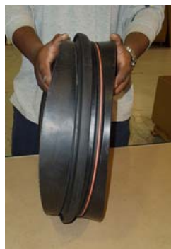
19. Assembled gasket, mandrel, and casting ring. The gasket assembly is ready to be placed into manhole form.

CAST-A-SEAL 603 Profile folded into casting position