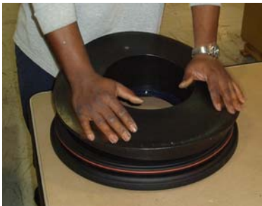
18. Make sure that casting ring and mandrel arcs are aligned.