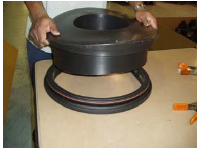
13. Place mandrel into folded gasket (orange stripe up).