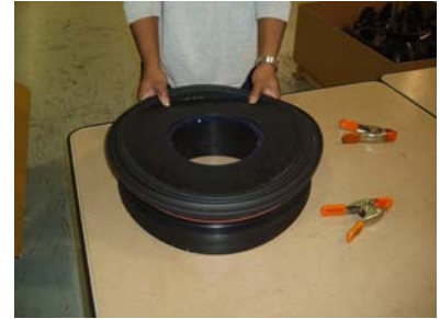
14. Press mandrel through gasket.