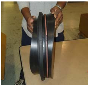
15. Mandrel with gasket installed.