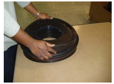
17. Press casting ring down.