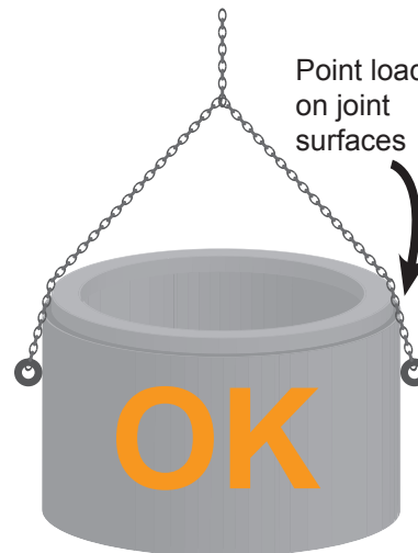
Single Point Lift