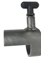
Mounted to allow concrete to bleed by

Mounting collar can have spring loaded collar pins on either side depending on producer's process's.