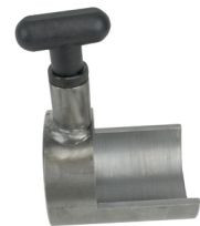
Mounted to allow concrete to collect in bottom

Press-Seal believes all information is accurate as of its publication date. Information, specifications, and prices are all subject to change without notice. Press-Seal is not responsible for any inadvertent errors. Copyright 2019.