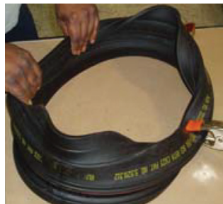
7. Again, fold top section into ID of gasket