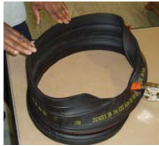
17. Press casting ring down