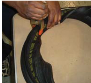
5. Apply clamp if needed