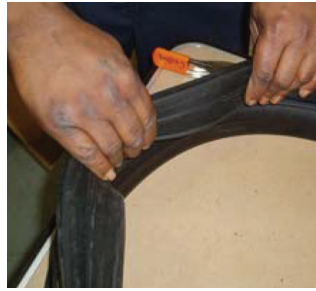
14. Press mandrel through gasket