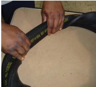
4. Fold section again into ID of gasket