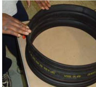
2. Grip top edge of gasket and..