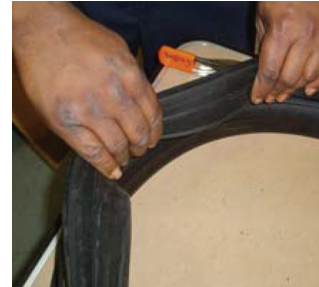
3. ...fold top 1/3 section into ID of gasket