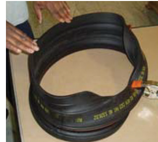
6. Rotate gasket 180 degrees.