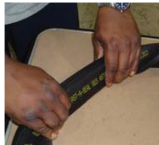
8. Repeat second fold