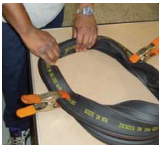
10. Rotate gasket to midpoint and repeat folding process