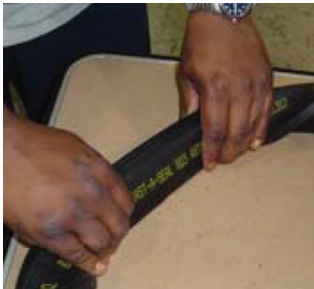
19. Assembled gasket, mandrel and casting ring. The gasket assembly is ready to be placed into manhole form