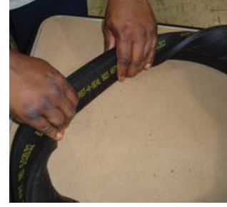
15. Mandrel with gasket installed