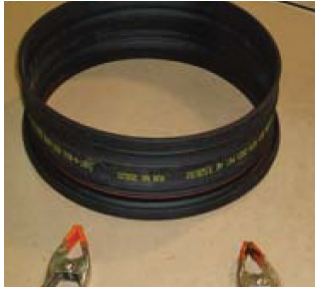
1. Place CAS 603 on flat surface with orange stripe up. Larger sizes may require clamps(s) to hold in place