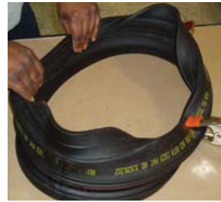
18. Make sure that casting ring and mandrel arcs are aligned