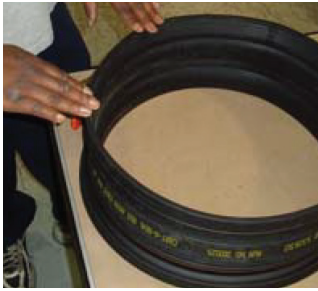
13. Place mandrel into folded gasket (orange stripe up)