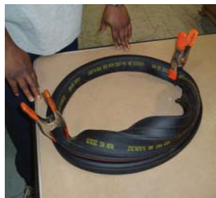
11. Complete section