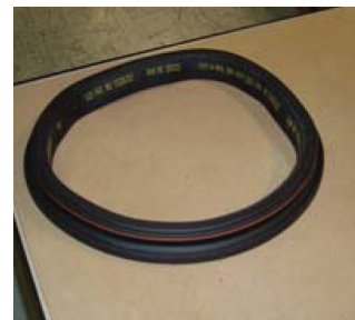
12. Completely folded gasket