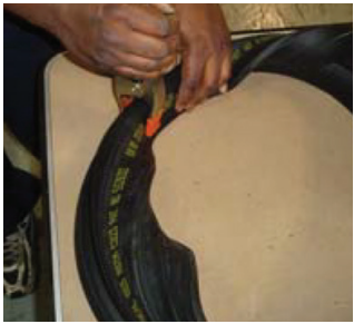
16. Fit casting ring behind gasket on mandrel, aligning arcs of both