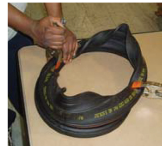
9. Apply clamp, if necessary