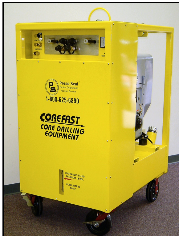
Shown Below: Corefast DPU-35

ALSO AVAILABLE: Power plants as large as 100 HP with up to 4 independent hydraulic circuits.