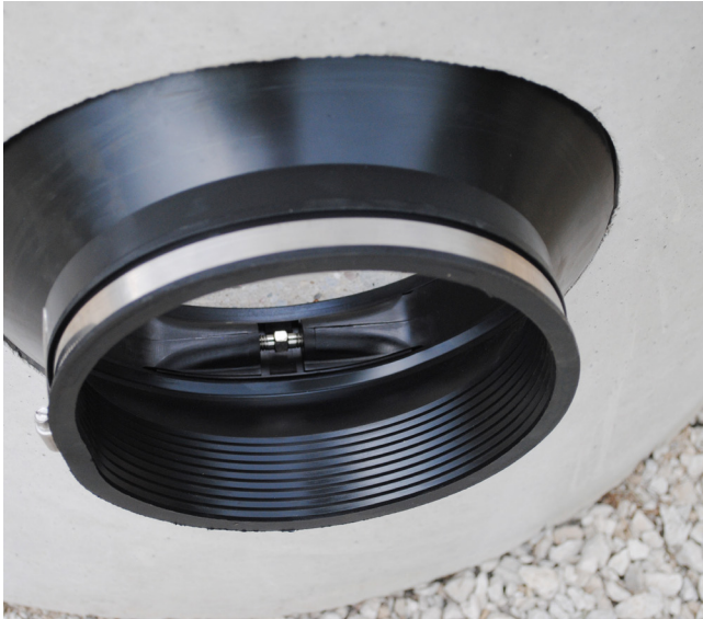
Expansion mechanism at bottom is for display purposes only. Press-Seal recommends installation between a 10:00 and 2:00 position.